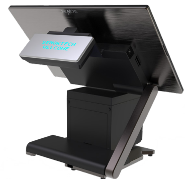
INTEGRATED 2-LINE DISPLAY MODULE