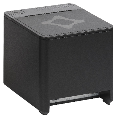
TRIPLE USB, SERIAL AND LAN INTERFACE