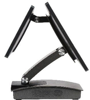
2 TILT JOINTS ON RIA POS STAND