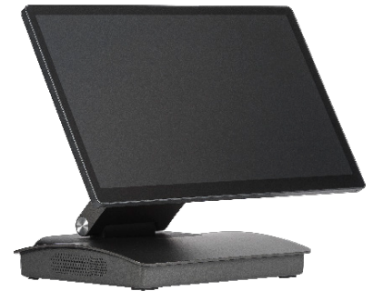
ALUMINIUM RIA POS WITH 16/9 SCREEN