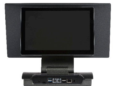
INTEGRATED CUSTOMER DISPLAY